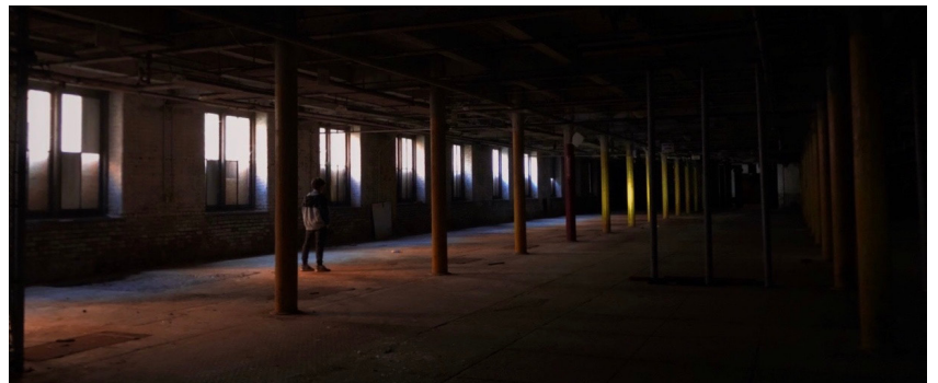
Pascalle Le Roy